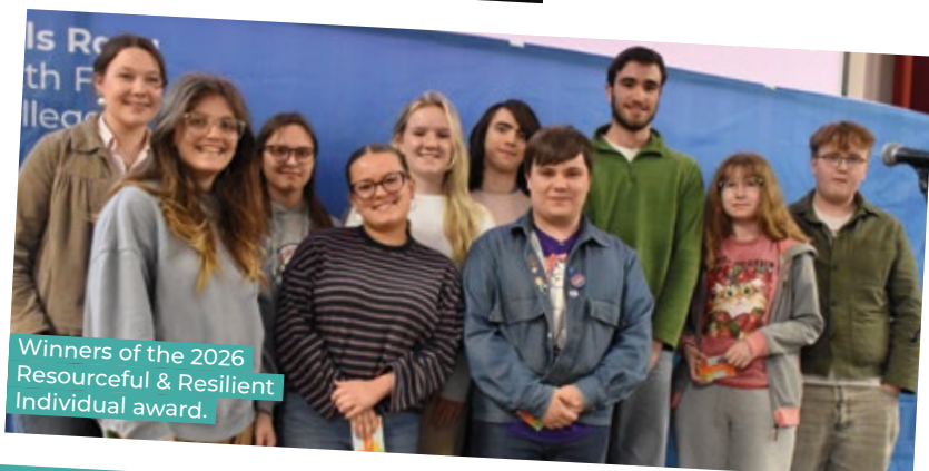
Winners of the 2026 Resourceful & Resilient Individual award.

See the full list of winners and watch the Year 13 celebration video at hillsroad.ac.uk/latest-news/student-awards-2026