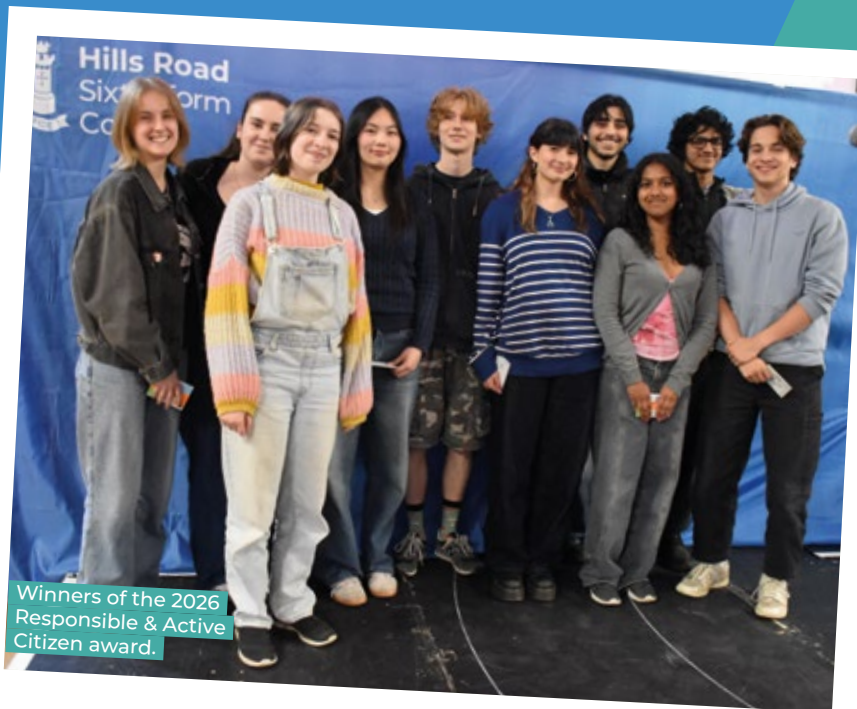
Winners of the 2026 Responsible & Active Citizen award.

“We are delighted to see so many of you recognised for the positive difference you make to the lives of others and to the wider College community.”