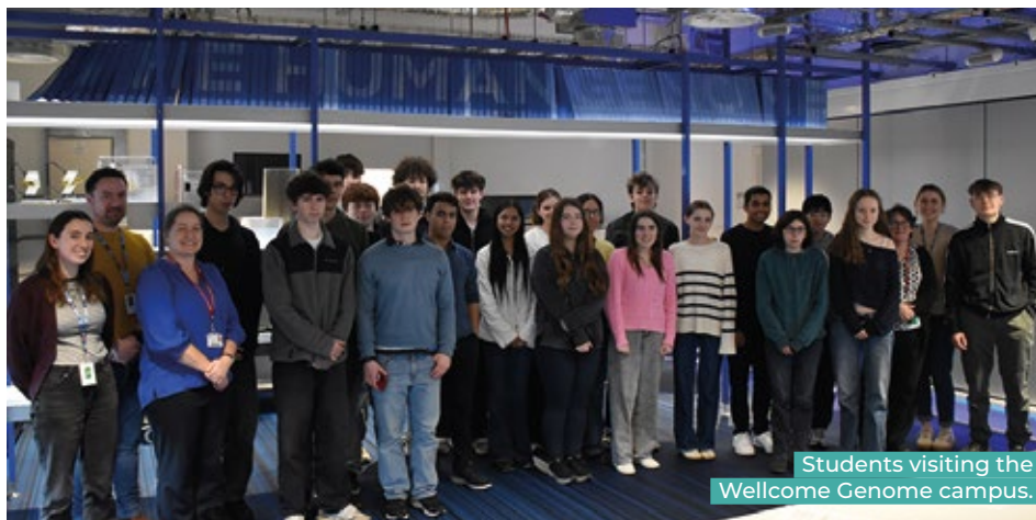
Students visiting the Wellcome Genome campus.