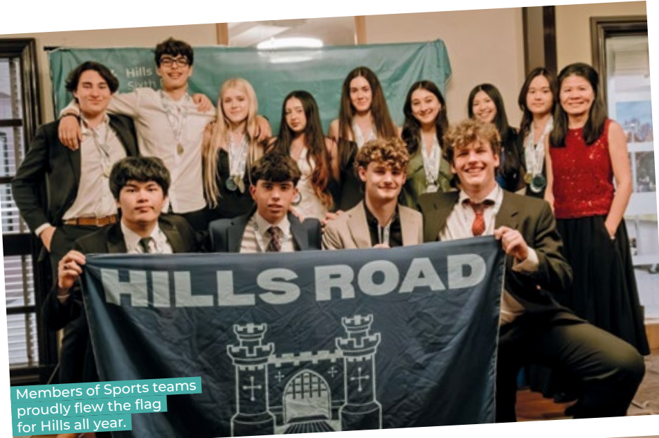
Members of Sports teams proudly flew the flag for Hills all year.

Award winners from across Hills Road's sports teams were recognised at the annual Sports Awards Evening, celebrating achievement, commitment and leadership throughout the 2025-26 season.