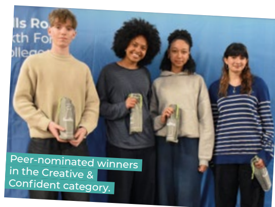
Peer-nominated winners in the Creative & Confident category.