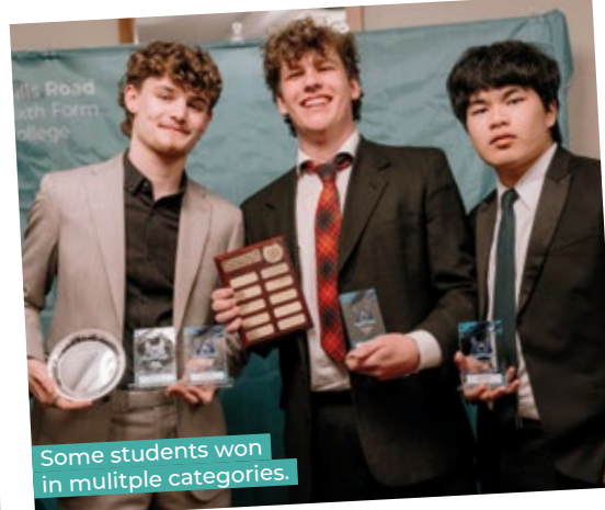
Some students won in multiple categories.