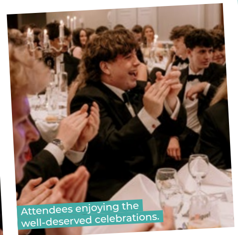
Attendees enjoying the well-deserved celebrations.