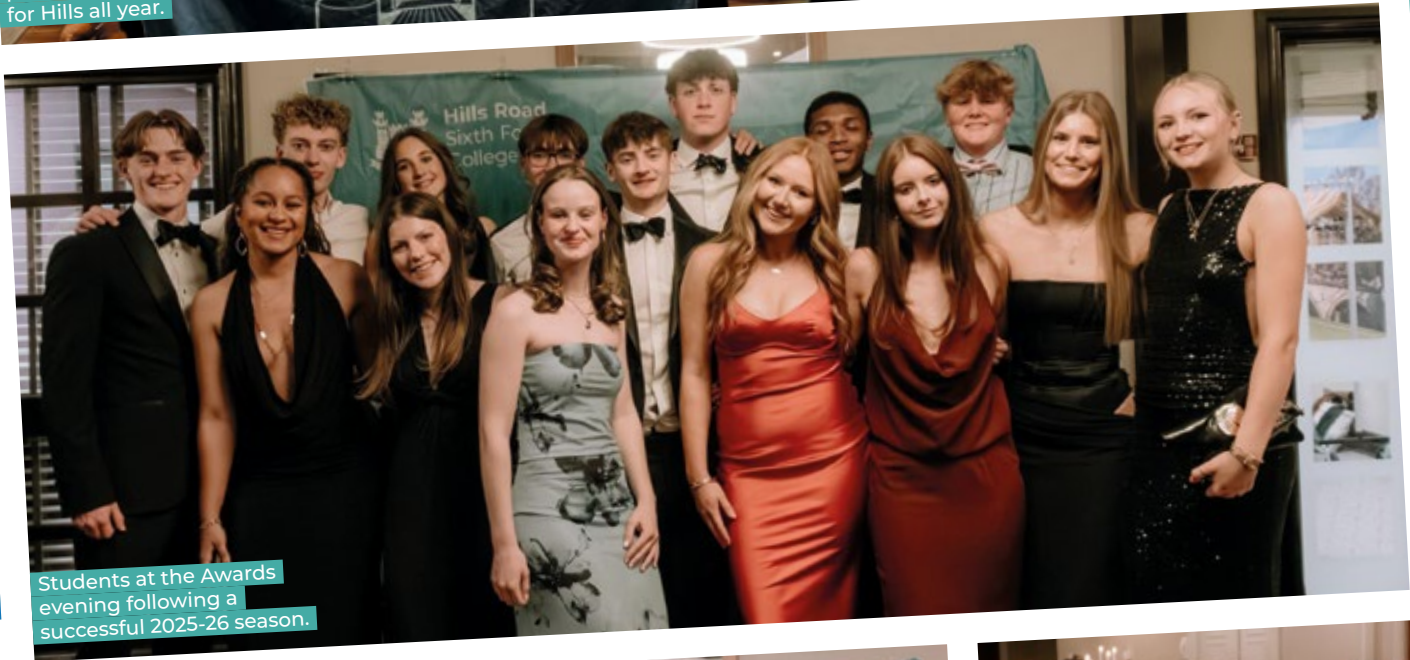
Students at the Awards evening following a successful 2025-26 season.

See the list of winners at: hillsroad.ac.uk/latest-news/sport-awards-2026