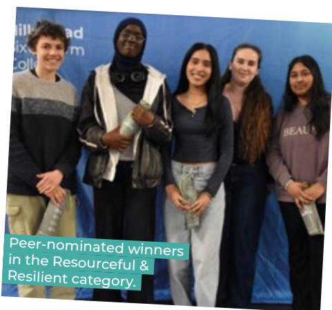
Peer-nominated winners in the Resourceful & Resilient category.

On Thursday 7 May, Year 13 were invited to celebrate the remarkable contributions they have made to life at Hills Road during their time at the College.