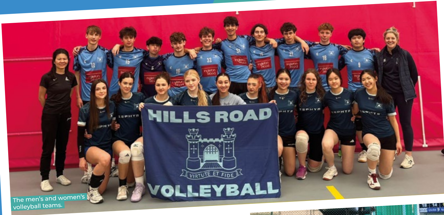
The men's and women's volleyball teams.